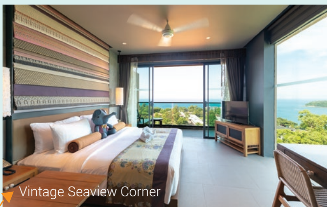
Vintage Seaview Corner

Amenities: Air-conditioning, Safety deposit box, Ashtray, Compact refrigerator, Flat screen TV, Open wardrobe, Spacious balcony, Flashlight, Slippers, Kettle, Mugs, Umbrellas, Bathrobes, Hangers, Writing desk some rooms: Outdoor bathtub, Indoor daybed, Electrical fan